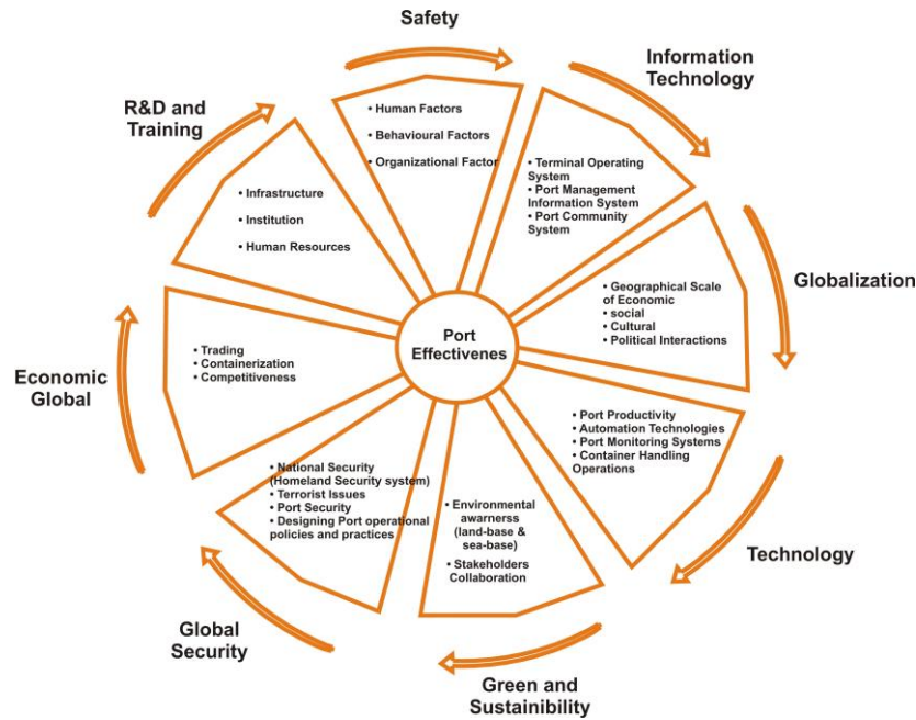
Figure 2: Port Effectiveness by applying the new model